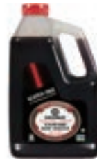
D-JF28008 GLUTEN FREE TAMARI SOY SAUCE 6/64 oz (1.89L) "KIKKOMAN"