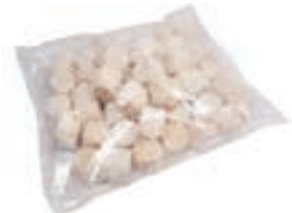
F-JF05132 SHRIMP SHUMAI 50PC /28OZ *6/1.76LB AJINIOMOTO