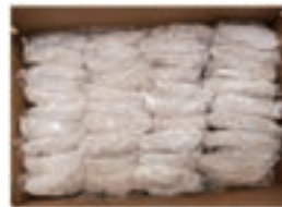
R-JF80325 NTF RAMEN NDL #24 STRAIGHT 40/150G