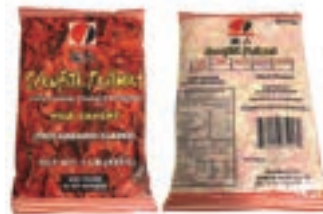
MH85164, 85165, 85166 CRAWFISH TAILMEAT 80-100 / 100-150 / 150-200 24 X 1 LB "TETSUJIN"