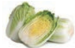
VEG-2001 배추 Napa Cabbage, approx. 30.0LB