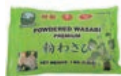
MH68888 WASABI POWDER 10 X 2.2 LBS (CHINA) "GREENLAND"