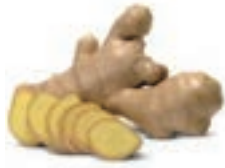
VEG-2021 생강 Fresh Ginger, approx. 30.0LB, NA