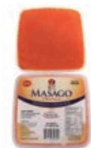
MH85030 MASAGO "TETSUJIN" NO MSG ICELAND WILD 4 X 4.4 LBS