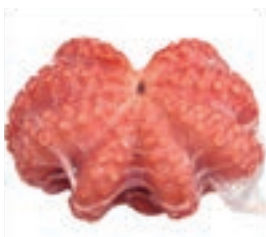
MH85075 MADAKO TAKO 5 CTS IVP 22 LBS "TETSUJIN"