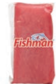
MH93101, 93100 TUNA SAKU (AAA, WAAA) 2 X 11 LBS "FISHMAN"