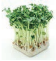
JB112024-2 무순 Kaiware, RADISH SPROUT 12/1box, NA