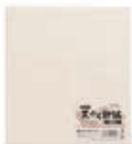
D-JF26986 HOSHITAKA TEMPURA SHIKIGAMI 120/100PC