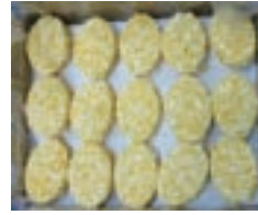
84303 KEIO VEG CROQUETTE TEZUKURI 60P FS3/9.2#