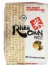
D-RCHUN 이천쌀 RHEE CHUN RICE 40LB