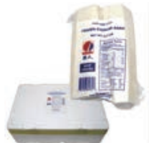
MH85031 ESCOLAR SAKU 10 X 2.2 LBS KOREA WILD "TETSUJIN"