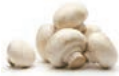
VEG-2011-3 루즈 머쉬룸 Loose Mushroom, Medium, 10LB, NA