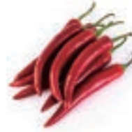
VEG-2022-1 붉은 고추 Red Hot Finger Pepper