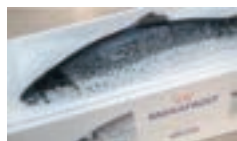
FRESH SALMON WHOLE Faroe Island Salmon 8+, approx. 2/18.75LB, NA