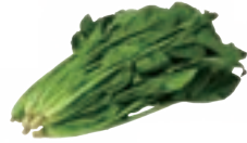
VEG-2044 중국 시금치 CHINESE SPINACH, 1BOX, NA