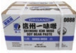
MH30888 MISO PASTE WHITE(SHIRO) 44LB(BULK) ORGANIC "TETSUJIN"