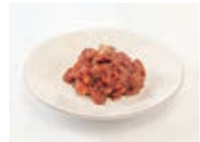
K-BULK 02 창란젓 Seasoned Pollack Entrails 22LB