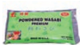
MH48888 WASABI POWDER 10 X 2.2 LBS (USA) "TETSUJIN"