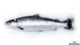
FRESH SALMON WHOLE Scottish Salmon 7/8, approx. 3/16.67LB, NA