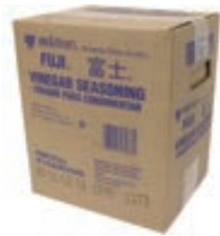
MH13086 FUJI BLENDED VINEGAR 1/5.28 gal "MIZKAN"