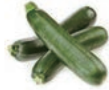
VEG-2006 쥬키니 호박 Zucchini, 1BOX, NA