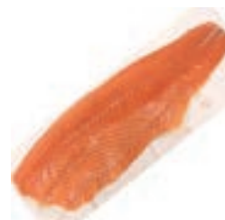
FRESH SALMON FILLET Canadian Salmon Fillet ***Fillet Only for both Price &Weight*** 8+