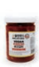
부추김치 Chives Kimchi CH-803 32oz