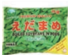
MH85988 EDAMAME 20 X 400G "GREENLAND"