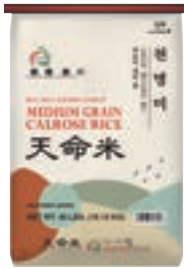
D-HS1001 천명미 CHUN MYUNG MI RICE 40LBS