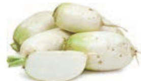
VEG-2002 한국무우 Daikon, approx. 50.0LB,