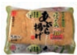
JF09926 ABURAAGE FZN 5PC 5/10/3.17OZ/EA