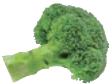
VEG-2014 브로컬리 Broccoli 1BOX, NA