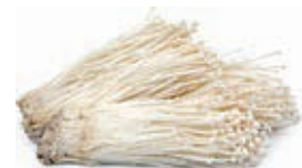
VEG-2011-2 팽이버섯 Enoki Mushroom, 20/200G, NA