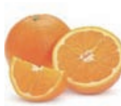
VEG-2030 오렌지 Orange, 88/CS, NA