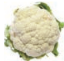
VEG-2024 컬리프라워 Cauliflower, 1box, NA