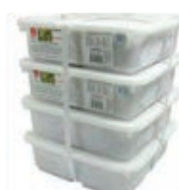
MH85160 HIAYASHI WAKAME SEAWEED SALAD 4 X 4.4 LBS "TETSUJIN"