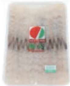
MH92881 NOBASHI EBI 21/25 30X20 PCS "TETSUJIN"