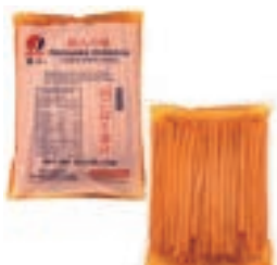
MH83042 YAMAGOBO 10 X 2.2 LBS "TETSUJIN"