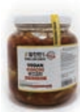
비건 썬김치 Vegan Sliced VS-802 64oz VS-803 32oz VS-804 16oz