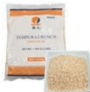
MH60008 TEMPURA CRUNCH ORIGINAL "TETSUJIN" 10/2.2LBS