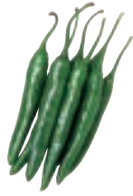
VEG-2022 한국고추 Korean Chillie Pepper