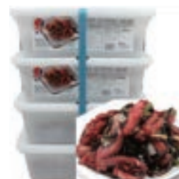
MH85167 OCTOPUS SALAD 4 X 4.4 LBS "TETSUJIN"