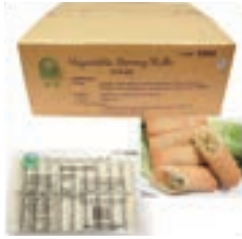
MH83888 1.5oz VEG. SPRING ROLLS 10 TRAYS X 20 PCS "GREENLAND"