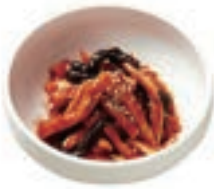
K-BULK 11 무말랭이 무침 Seasoned Sliced Radish 22LB