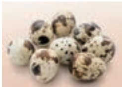
R-QUAILEGGS UZURA (QUAIL EGG) 20/1BOX