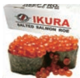
MH92080 IKURA (SALMON ROE) 12/1KG PINK "MARUBENI" WILD USA