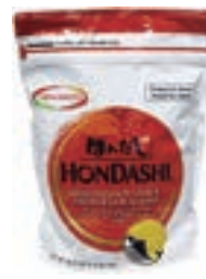
D-MH39854-11 HONDASHI SOUP STOCK NEW 12/2.2LB "AJINOMOTO"