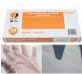
MH91021 GLOVE DISPOSABLE "M" 40 x 100 PCS