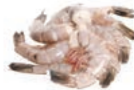
F-HS0415 FZ SHRIMP WH 21/25 (HLSO) 6/4LB