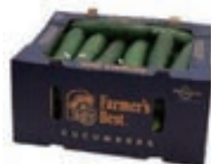
VEG-2003 오이 Large Cucumber, 50LB, NA