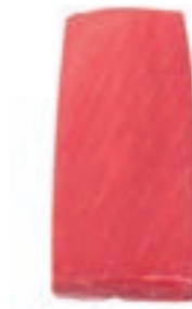
MH98990 TUNA SAKU AAA+ YF 2/11LB SUPER IQF THAI "TETSUJIN"