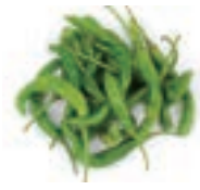
VEG-2022-2 파리고추 Shishito Pepper