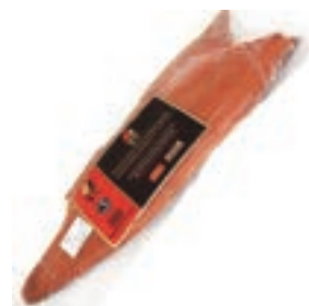
MH84926 SMOKED SALMON 4-6 COLD SMOKED IN USA "TETSUJIN"