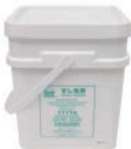
MH77778 (Net 20lbs) PREMIUM SUSHI GINGER WHITE "GREENLAND"