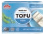
R-E068381 SOFT TOFU BLUE 12/12OZ "MORI-NU"