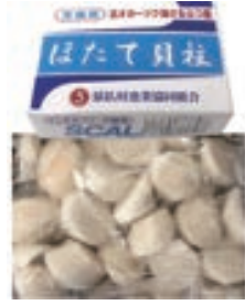
MH82890 HOTATE SCALLOP SEA 16/18CT IQF 2/2.2LB DRY 2S HOKKAIDO JAPAN