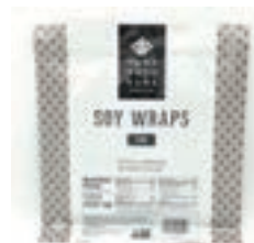
1442D MAMENORI SOY PAPER - PINK, 10/20PC, YAMAMOTO