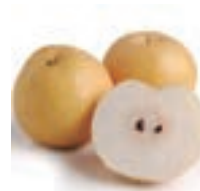
VEG-2034 한국배 Korean Pear, 1box, NA