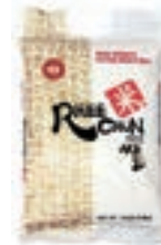
D-RCHUN-1 이천쌀 RHEE CHUN RICE 15LB