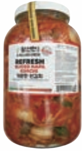
개운한 포기 Refreshing Whole R-P800 5G (bulk) RW-861 1G RW-862 64oz 개운한 썬 Refreshing Sliced RS-870 5G (bulk) RS-871 1G RS-872 64oz RS-873 32oz RS-874 16oz