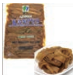
MH79835 AJITSUKE KANPYO 10 x 2.2 LBS "TETSUJIN"