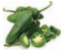
VEG-2022-4 할라피뇨 Jalapeno Pepper, approx. 35.0LB, NA