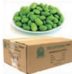
MH80900 SHELLED EDAMAME 1 X 20 LBS "GREENLAND"