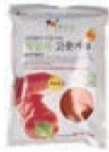
HS-122-11 풀잎새 고운 고춧가루 RED PEPPER POWDER FINE 10/2.2LB