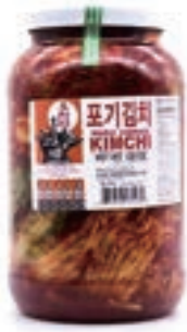
포기 WHOLE C2-1GAL C3-64OZ