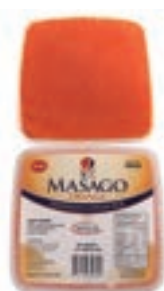
MH85029 MASAGO "TETSUJIN" 8 X 2.2 LBS