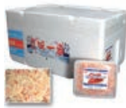
MH20119 CRAWFISH SALAD 20 x 1.43 LBS "IYOYA"