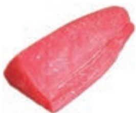
MH86008 TUNA LOIN 30 LBS 5-8 LBS