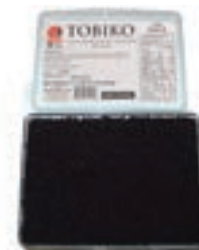
MH85016 TOBIKKO BLACK 12X1.1LBS "TETSUJIN"