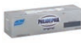
PHILACREAM CREAM CHEESE LOAF 10/3LB(48OZ) "PHILADELPHIA"