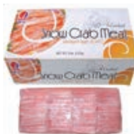
MH85071 SNOW CRAB MEAT COMBO 6 X 5 LBS "TETSUJIN"