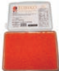
MH85018 TOBIKKO ORANGE 12X1.1LBS "TETSUJIN"