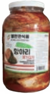
항아리 포기 Hang-A-Ri Whole HP-811 1G 항아리 썬 Hang-A-Ri Sliced HS-821 1G HS-822 64oz HS-823 32oz