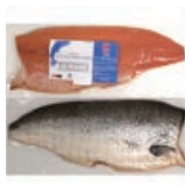
MH84988 SMOKED SALMON 4-6 COLD SMOKED CHILE "TETSUJIN SELECT"