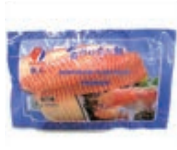
MH85020 IZUMI DAI TAIWAN 9 OZ UP 22 LBS "TETSUJIN"