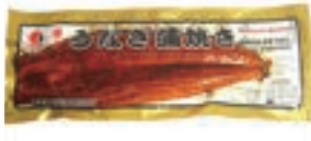
MH25888 KABAYAKI UNAGI "TETSUJIN" 10 OZ