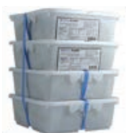
MH85157 HIYASHI WAKAME SEAWEED SALAD 4 X 4.4 LBS "MARINE FOOD"