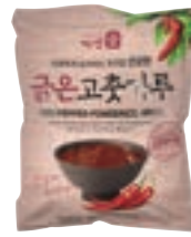
H-0846034-5 자연애 굵은고춧가루 RED PEPPER POWDER COARSE 6/5LB