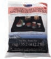
MH22338 HOKKIGAI SURF CLAM "L" 10/1KG WILD CANADA/PK