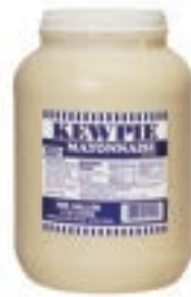
JF28463 MAYONNAISE BLUE LABEL 4/1GAL "KEWPIE"