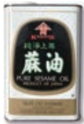
D-307106011 PURE SESAME OIL 10/56FLOZ "KADOYA"