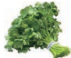
VEG-2025 실란초 Cilantro, 60/bunch, NA