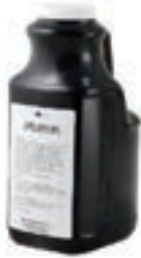
D-JF62906 SHOYU Ramen Soup Soy Sauce Flavor 6/64oz(1.89L) "MYOJO"