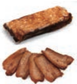
MH74020 CHAR SIU PORK (7-12PK) 22.04LB NO MSG "NH" (ROLLED)