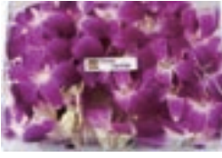
FLOWER ORCHID FLOWER FOR SUSHI DECORATON 1CS (SMALL PACK), NA