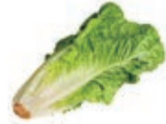
VEG-2009 로메인 Romaine Lettuce, 1box, NA