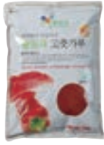
HS-122-12 풀잎새 굵은 고춧가루 RED PEPPER POWDER COARSE 10/2.2LB