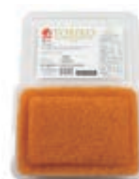
MH85013 TOBIKKO GOLD 12X1.1LBS "TETSUJIN"