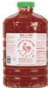
D-G080841 CHILI GARLIC SAUCE 3 X 8.5 LB. JUG "HUY FONG"