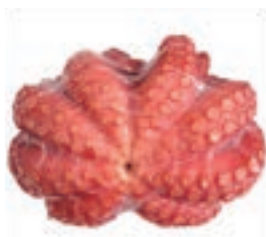
MH85074-1 MADAKO TAKO 4 CTS IVP 22 LBS "TETSUJIN"