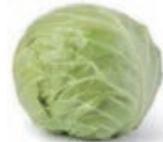
VEG-2010 양배추 Cabbage, approx. 50.0LB, NA