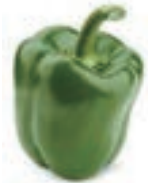
VEG-2022-7 피망 초록 Green Pepper, 1box, NA