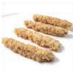
MH85007-1 SHRIMP TEMPURA 24G PRE-FRIED 4/30PC TAILOFF VIET