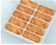
F-UNI UNI SEA URCHIN ROE 1TRAY, NA