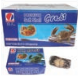
MH99811, 99812, 99813 SOFT SHELL CRAB Hotel, Prime, Jumbo 6 X 1 KG (2.2 LBS) "TETSUJIN"