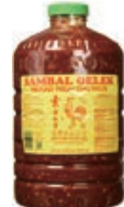
D-SAMBAL81100 SAMBAL OELEK SAUCE 3 X 8.5 LB. JUG "HUY FONG"