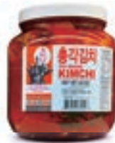
총각김치 TOP RADISH I2-1GAL I3-64OZ I4-32OZ