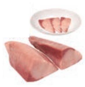
MH85147 HAMACHI LOIN W/CO 2 X 11 LBS "TETSUJI N" JAPAN