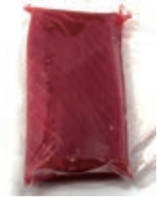
MH85094 BF TUNA SAKU (AKAMI) 2 X 11 LBS "TETSUJIN"