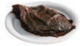
BULK-02 양념 깻잎 Seasoned Sesame Leaves 22LB