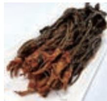
K-BULK 12 고들빼기 Seasoned Lettuce Chungyang 22LB