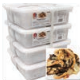
MH85045 CHUKA IKA SANSAI (CALAMARI SALAD) 4 X 4.4 LBS "TETSUJIN"