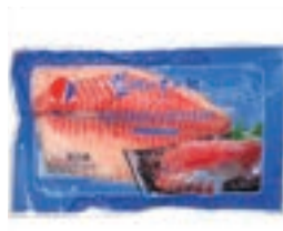
MH85021 IZUMI DAI TAIWAN 11 OZ UP 22 LBS "TETSUJIN"