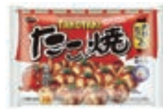
13439 TAKOYAKI JUMBO 18PC 10/19OZ(540G)