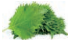
VEG-2027-1 시소 (오바) Shiso/Ohba Leaves Bunches, 1 Small Pack, NA