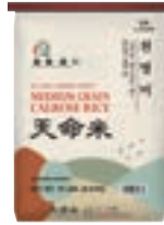
D-HS1010 천명미 CHUN MYUNG MI RICE 15LBS