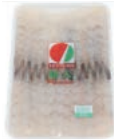
MH92882 NOBASHI EBI 26/30 30X25 PCS "TETSUJIN"