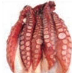
MH85078 NOBASHI MADAKO LEG ONLY 4-6 PCS 22 LBS "TETSUJIN"