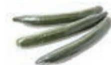
VEG-2003-2 씨없는 오이 Seedless Cucumber, 12PC, NA