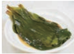
K-BULK 08 명이나물 Pickled Garlic Leaves 22LB