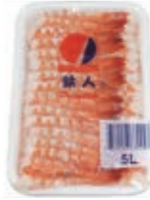
MH69804 SUSHI EBI (5L) 20TRAYS X 30 PCS