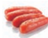
K-BULK 01 명란젓 Seasoned Pollack Roe 22LB