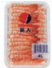
MH69803 SUSHI EBI (4L) 20TRAYS X 30 PCS