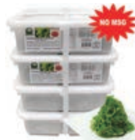
MH85161 HIYASHI WAKAME NO MSG KOSHER 4/4.4# "GREENLAND"