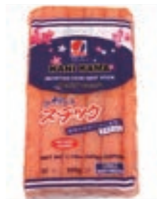
MH85180 KANIKAMA STICK 20 X 1.1 LBS "TETSUJIN"