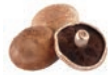
VEG-2011-4 포토벨로 머쉬룸 Portabello Mushroom, 1BOX, NA