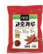
R-PG2301 태경 김치용 고춧가루 RED PEPPER POWDER COARSE 30/1LB