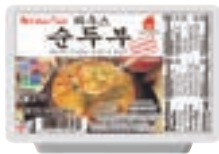
R-30047 EXTRA SOFT TOFU 24/12OZ "HOUSE"