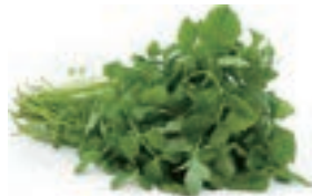
VEG-2023 미나리 Water Dropwort