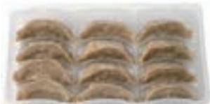
PREMIUM GYOZA IN TRAY PORK/CHICKEN/SHRIMP/VEGETABLE 24 TRAYS X 12 PCS(7.6oz) "TETSUJIN" U.S.A