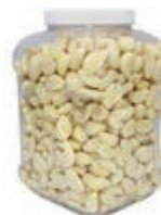
VEG-2020 깎마늘 Peeled Garlic 5LB, 4/Jar, NA