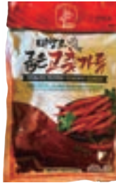
D-JB22153 사슴표 굵은 고춧가루 RED PEPPER POWDER COARSE 6/5LB