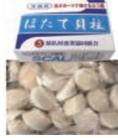
MH82882 HOTATE SCALLOP SEA 18/23CT IQF 2/2.2LB DRY 3S HOKKAIDO JAPAN