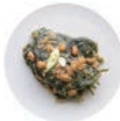
K-BULK 05 된장콩잎 Bean Leaves in Soybean Paste 22LB