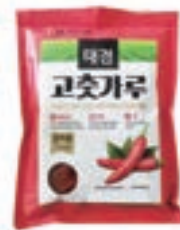
R-PG2302 태경 김치용 고춧가루 RED PEPPER POWDER COARSE 10/3LB