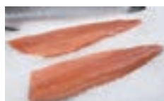
SALMON FILLET-SKIN OFF Scottish Salmon Fillet ***Fillet Only for both Price &Weight*** 8+