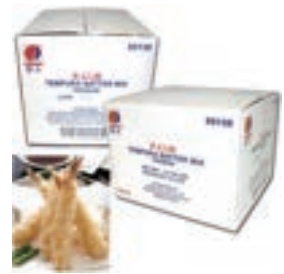
MH85138 TEMPURA BATTER MIX 30LB "TETSUJIN"