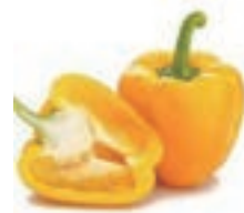
VEG-2022-6 피망 노랑 Yellow Pepper, 1box, NA