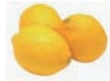
VEG-2031 레몬 Lemon, 165/pc, Fancy, ARG