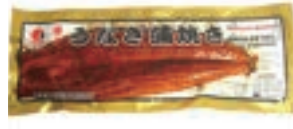
MH26888 KABAYAKI UNAGI "TETSUJIN" 11 OZ