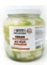
비건 백김치 Vegan White VW-801 1G VW-802 64oz VW-803 32oz