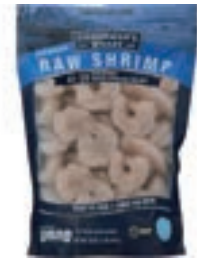
F-HS4050 RAW SHRIMP PEELED&DEVEINED TAIL OFF 41-50