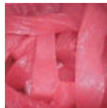
MH85066 TUNASTRIPS 2X11 LBS "TETSUJIN" (INDONESIA)