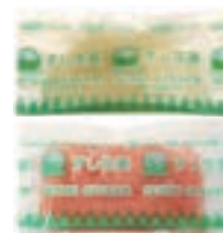
MH72688 & 71488 PORTION PACK GINGER WHITE NATURAL & PINK 5g 5 X 200 PACKS "GREENLAND"