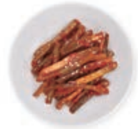
K-BULK 10 양념마늘줄 무침 Seasoned Garlic Stems 22LB