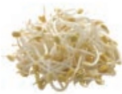
콩나물 SOYBEAN SPROUTS R-UJ26461-1 28/1LB R-UJ26462 15/2LB R-UJ2646 15LB