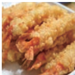
MH16999 SHRIMP TEMPURA (PRE-FRIED) 16/20 TAIL ON 4 X 30PC VIETNAM "TETSUJIN"