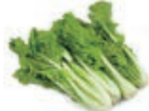
VEG-2001-1 얼갈이 (풋배추) Baby Napa, 1BOX, NA