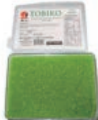
MH85015 TOBIKKO WASABI 12X1.1LBS "TETSUJIN"