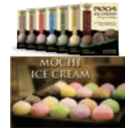
F-MOCHI PK1 - PK9 MOCHI ICE CREAM 12 X 7.5OZ (6PCS) "MIKAWAYA"