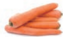
VEG-2017 당근 Carrot Jumbo 50LB, NA