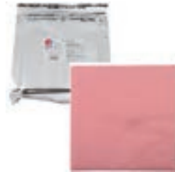
MH08410 MAMENORI SOY SHEET (PINK) 10/20SHEET "TESTUJIN"