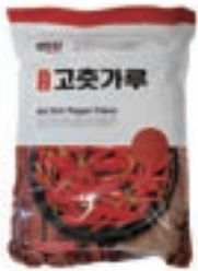
AS05029D 아씨 굵은 고춧가루 RED PEPPER POWDER COARSE 8/5LB