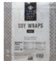
1042D MAMENORI SOY PAPER - GREEN, 10/20PC, YAMAMOTO