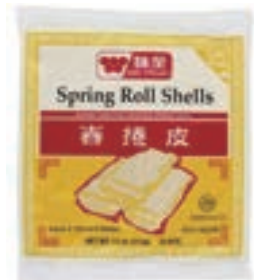
G399570 EGG ROLL SKIN 40PK X 11OZ