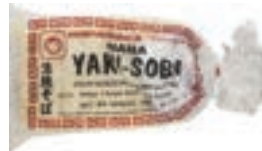
MH34184 NAMA YAKISOBA NOODLE 2/10/16.93OZ "MARUCHAN"