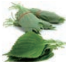
VEG-2027 갯잎 Perilla/Sesame Leaves