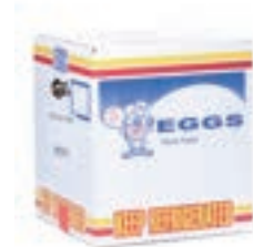
R-EGGS EGGS GRD A 15DZ