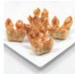
MH68889, 92890 CRAB/LOBSTER RANGOON 0.8OZ 5 TRAYS X 20 PCS GREENLAND USA