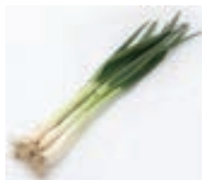
VEG-2015 대파 Large Green Onions, 1BOX, NA