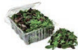
VEG-2035 스프링 믹스 Spring Mix (Clear Plastic Box), 2LB, NA