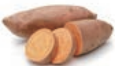
2564 고구마 American Sweet Potato (Jumbo), approx. 40.0LB, NA