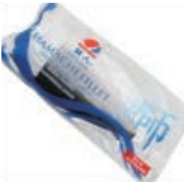
MH85192 HAMACHI FILLET AVG 6/2.4KG "TETSUJIN" GREEN 31.95LB JAPAN