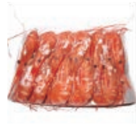
MH85085-MH85087 AMA EBI L, XL, JUMBO RED CORAL 12 X 1 KG CANADA