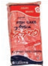
MH85143 KANIKAMA STICK "OSAKI" 2 X 20 X 1.1 LBS