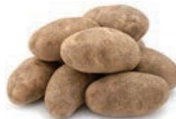
VEG2018 감자 (아이다호) Potato, approx. 50.0LB, NA