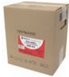
MH64332 (MD-43) NO MSG SUSHI SU (SWEETER) 1/5 gal "MIZKAN"