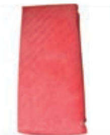
MH85060, 85113 TUNA SAKU (AAA, WAAA) 2 X 11 LBS "TETSUJIN"