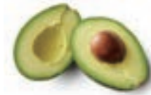
VEG-2007 아보카도 Avocado 48 Count, 48PC, NA