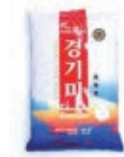
D-CS1102A 경기미 KYUNGGI RICE 15LB