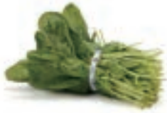
VEG-2004 시금치 Spinach, 24/Bunches, NA