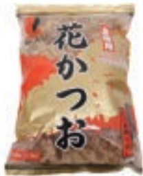
MH39888 BONITO FLAKES (HANA KATSUO) 6/1 LB "TETSUJIN" JAPAN