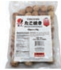
MH61888 TAKO YAKI GRILLED OCTOPUS BALL 4PK/45PC/30G "TETSUJIN"