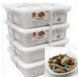
F-MH85598 SHITAKE MUSHROOM SALAD "TETSUJIN" 4/4.4LBS