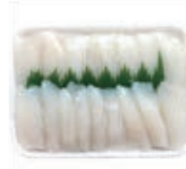
MH95808 & MH95809 MONGO IKA 12/15(M) & 16/18(S) 10 X 500g