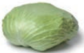
VEG-2010-1 타이완 양배추 Taiwanese Cabbage, approx. 50.0LB, NA