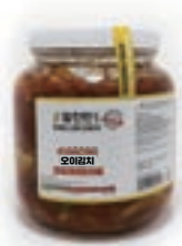
오이김치 Stuffed Cucumber SC-801 1G SC-802 64oz