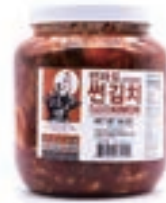
전라도 포기 JUN WHOLE E2-1GAL E3-64OZ