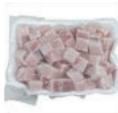
MH69850 ALBACORE TUNA CUBE 10 X 1 LB KOREA "TETSUJIN"