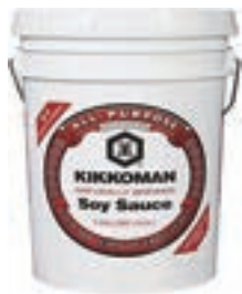
D-HSK1001 SOY SAUCE 5GAL "KIKKOMAN"