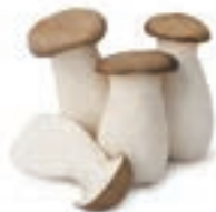
VEG-2011 새송이 버섯 King Oyster Mushroom