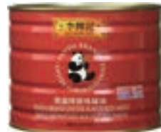
D-F086080 OYSTER SAUCE PANDA 6/5LB "LEE KUM KEE"