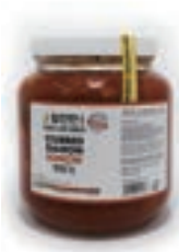
깍두기 Cubed Radish CR-890 5G (bulk) CR-891 1G CR-892 64oz CR-893 32oz CR-894 16oz