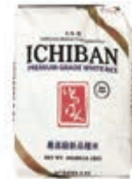
D-H14398 이치반 ICHIBAN MEDIUM GRAIN RICE 40LB