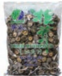
MH10489 DRIED SHITAKE MUSHROOM 4-5CM 6/5LB