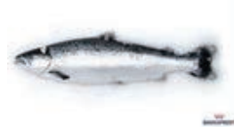
FRESH SALMON WHOLE Canadian Salmon Salmon 8+, approx. 2/20.0LB, NA