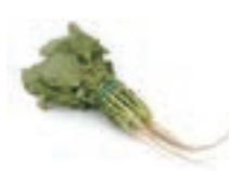
VEG-2001-2 얼무 Young Radish, 1BOX, NA