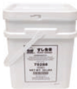
MH70288 (Net 20lbs) STANDARD SUSHI GINGER PINK "GREENLAND"