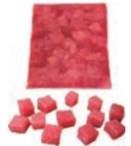
MH85065, 85116 TUNA CUBE 2 X 11 LBS "TETSUJIN" (INDONESIA/PHILIPINES)