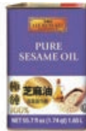
D-LLK087238 PURE SESAME OIL 10/56FLOZ "LEE KUM KEE"