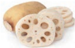
VEG-2028 연근 Lotus Root, 1box, NA