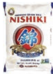
D-JF28580 니시키 NISHIKI PREM RICE 50LB