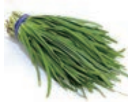
VEG-2012 중국부추 CHIVES 1BOX, NA