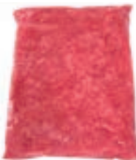
MH85064 TUNAGROUND 2X11 LBS "TETSUJIN" (INDONESIA)