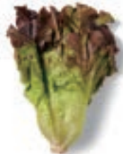
VEG-2009-1 적상추 Red Leaf Lettuce, 24PC, NA