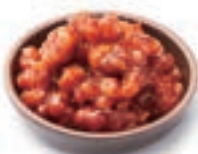
K-BULK 03 낙지젓 Seasoned Poulp Squid 22LB