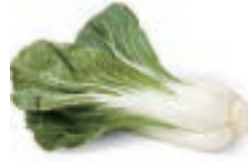
VEG-2005 박초이 청경채 Bok Choy, approx. 30.0LB, NA