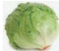
VEG-2009-3 양상추 Iceburg Lettuce, 24PC, NA