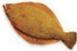
F-1001 광어 (매운탕용, 필렛) JEJU LIVE FLUKE /LB