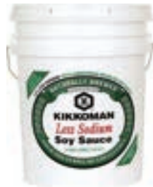
D-HSK1002 SOY SAUCE LESS SODIUM 5GAL "KIKKOMAN"