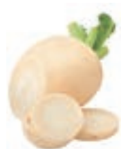
VEG-2002-1 동치미 무우 Dongchimi Radishi, 1BOX, NA