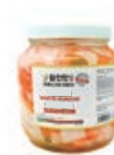
나박김치 Radish & Cabbage RC-802 64oz