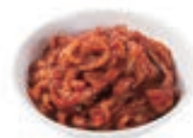
K-BULK 04 오징어젓 Seasoned Sliced Squid 22LB