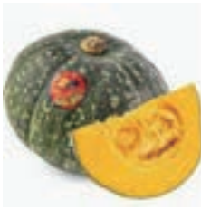
VEG-2006-1 단호박 Kabocha Squash, approx. 40.0LB, NA