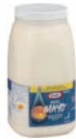
RD642199 MAYONNAISE(REAL) 4/1GAL "KRAFT"