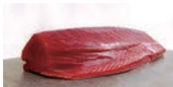
FRESH TUNA B/E TUNA BIG EYE #1