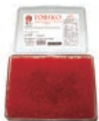
MH85017 TOBIKKO RED 12X1.1LBS "TETSUJIN"