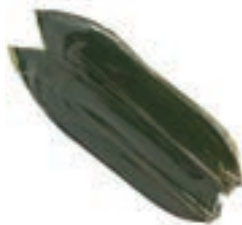
MH04524 SASA NO HA BAMBOO LEAF BOILED SHEET 30/1 OOPC FROZEN