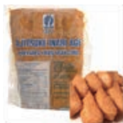
MH79836 AJITSUKE INARI 10 X 60pcs "TETSUJIN"