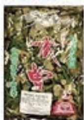
YA113123 산사이미즈니 SANSAIZUKE DORAKU 15/1.98#