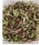
JB112024-3 마이크로 그린 Micro Greens, 1box, NA