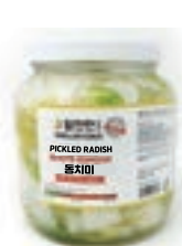
동치미 Radish Pickled HD-851 1G HD-852 64oz