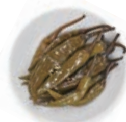
K-BULK 06 간장고추 Pepper in Soy Sauce 22LB