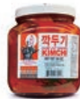
깍두기 CUT RADISH L2-1GAL L3-64OZ L4-32OZ L5-16OZ