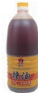
MH90289 RAYU HOT SESAME OIL 6/1650G (3.63LB) "TETSUJIN"