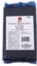
MH84909 ROASTED SESAME BLACK 12/2.2LB