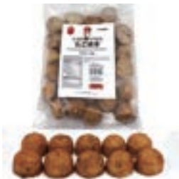
MH71899 TAKO YAKI FLAT BOTTOM GRILLED OCTOPU BALLS 12PK/30PC/30G TETSUJIN