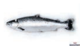
FRESH SALMON WHOLE Scottish Salmon 8+, approx. 2/20.0LB, NA