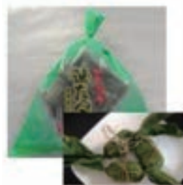
YA230100, 230101 SASADANGO MINATO 10PC/15, 10PC /20