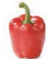
VEG-2022-5 피망 빨강 Red Pepper, 1box, NA