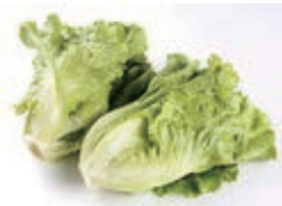
VEG-2009-2 상추 Green Leaf Lettuce, 24PC, NA