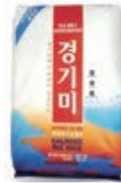
D-H31101501 경기미 KYUNGGI RICE 40LB