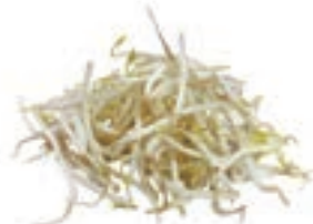
숙주나물 GREENBEAN SPROUTS R-UJ2648-1 20/1LB R-UJ2648-15 15LB