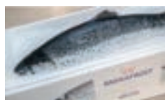
FRESH SALMON WHOLE Faroe Island Salmon 7/8kg, approx. 3/16.67LB, NA