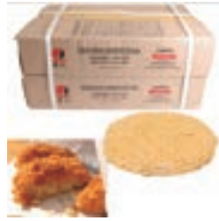
MH16899 VEGETABLE CROQUETTE (60g) 100pcs x 2 (Bundle) "TETSUJIN"