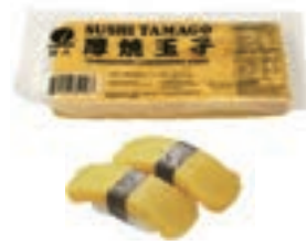
MH85156 ATSUYAKI TAMAGO 20 X 1.1 LBS (JAPAN) "TETSUJIN"