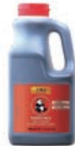
D-F086080 OYSTER SAUCE PANDA 6/5LB "LEE KUM KEE"