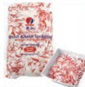
MH85186 KANIKAMA SHRED 12 X 2.5 LBS "TETSUJIN"