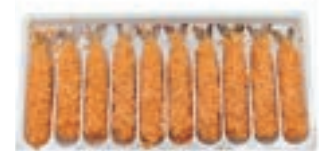
MH68809 Panko Breaded Shrimp (Ebi Fry) 28G 12TRAY X 10PC INDONESIA "TETSUJIN"