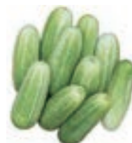
VEG-2003-1 피클오이 Pickle, 1BOX, NA