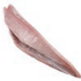
MH65887 ALBACORE TUNA LOIN 22 LB IVP "TETSUJIN" WILD KOREA