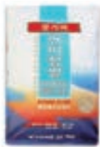
D-CC1010 경기미 현미찹쌀 KYONGGI BROWN SWEET RICE 15LB