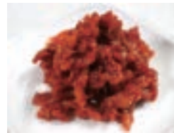
BULK-01 명태 회 무침 Seasoned pollack Sashimi 22LB