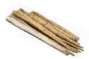
VEG-2029 우영 Burdock Root, 1box, NA