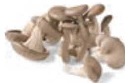
VEG-2011-1 느타리버섯 Oyster Mushroom