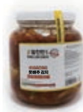
풋배추 김치 Young Cabbage YC-801 1G YC-802 64oz YC-803 32oz