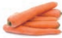
VEG-2017-1 당근 루즈 Carrot Loose 25LB, NA