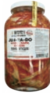
전라도 포기 Junlado Whole JW-800 5G (bulk) JW-801 1G JW-802 64oz 전라도 썬 Junlado Sliced JS-801 1G JS-802 64oz JS-803 32oz JS-804 16oz