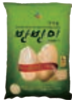
CJ1020766 반반미 BARN BARN MEE 15LB