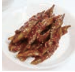
K-BULK 07 양념고추무침 Seasoned Whole Pepper 22LB