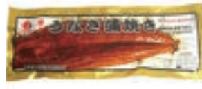
MH27888 KABAYAKI UNAGI "TETSUJIN" 12 OZ