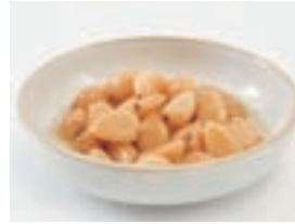
K-BULK 09 알마늘절임 Pickled Peeled Garlic 22LB