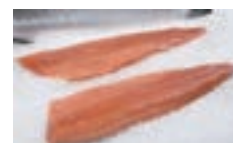
FRESH SALMON FILLET Faroe Island Salmon Fillet ***Fillet Only for both Price &Weight*** 8+