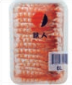
MH66005 SUSHI EBI (6L) 20TRAYS X 30 PCS