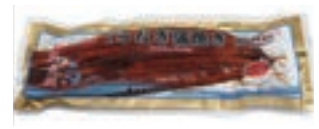
MH54888 KABAYAKI UNAGI "TETSUJIN" 11 OZ