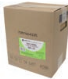
MH64335 (SD-51) NO MSG SUSHI SU (SWEETEST) 1/5 gal "MIZKAN"