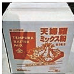
Y101034 TEMPURAKO GOLD 30LB "YAMASHO"