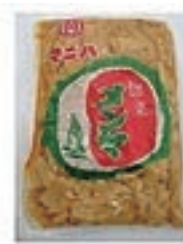
110019 MENMA AJITSUKE SEASONED BAMBOO SHOOTS 10 X 2.2 LBS "TETSUJIN"