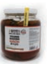
열무김치 Baby Radish BR-801 1G BR-802 64oz