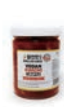
파김치 Green Onion GO-803 32oz