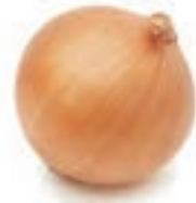
VEG-2013 양파 Yellow Spanish Onion, approx. 50.0LB, NA