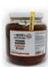
총각김치 Young Radish YR-881 1G YR-882 64oz