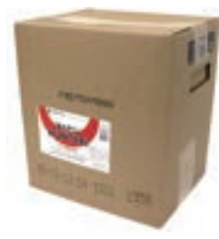
MH97086 HONTERI SWEET COOKING SEASONING 1/5 gal "MIZKAN"