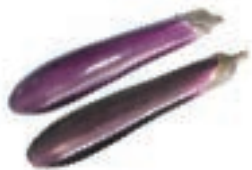
VEG-2026 가지 Chinese Eggplant, 1box, NA